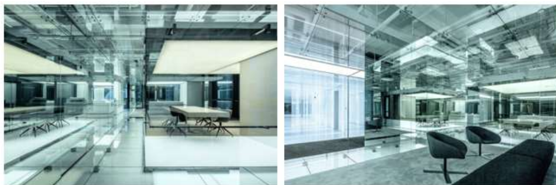
Figure 6. Visual extensibility and openness

The partition, wall and floor areas are designed with glass materials, which makes the space more visual malleable and open. As shown in Figure 6. Visual extensibility and openness.