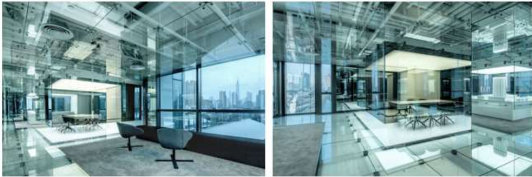
Figure 5. Glass office

The partition, wall and floor areas are designed with glass materials, which makes the space more visual malleable and open. As shown in Figure 6. Visual extensibility and openness.