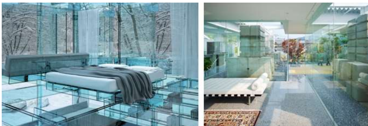
Figure 2. Tempered glass in interior

The main raw materials of glass materials are quartz, limestone, soda ash and other auxiliary materials, which are melted at high temperature. After cooling, transparent solid is formed. Its chemical formula is not easy to change, and it has strong resistance to various weather conditions. For example, tempered glass and laminated glass have been widely used in modern interior space design, as shown in Figure 2. Tempered glass in interior.