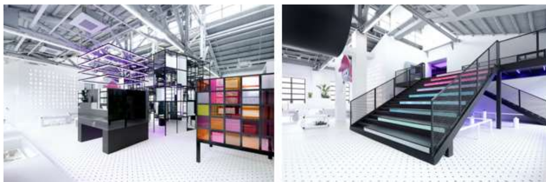
Figure 9. Colorful glass

In the space, black and white are used as the main color of the room, and colorful art installations are added to fully reflect the colorful glass, as shown in Figure 9. Colorful glass.