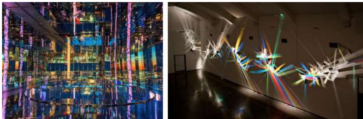
Figure 1. Transparency and Refraction