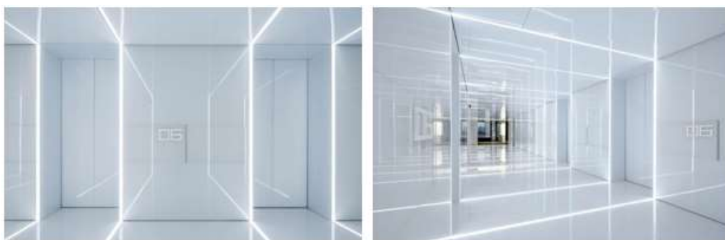
Figure 7. Glass and light and shadow

In the scheme design, the design method of combining glass with light and shadow and the glass reflection effect are used to make the space effect more sci-fi and cutting-edge, as shown in Figure 7. Glass and light and shadow.