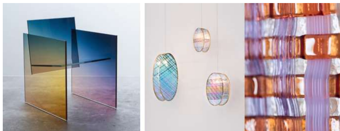
Figure 4. Glass diversity

At present, glass materials can be processed into frosted glass, polished glass, colored glass, spray glass and other glass styles. These rich styles make the interior design effect more interesting. The new form of glass material can be used to create handicrafts of different styles, and the modeling is more artistic, as shown in Figure 4. Glass diversity.