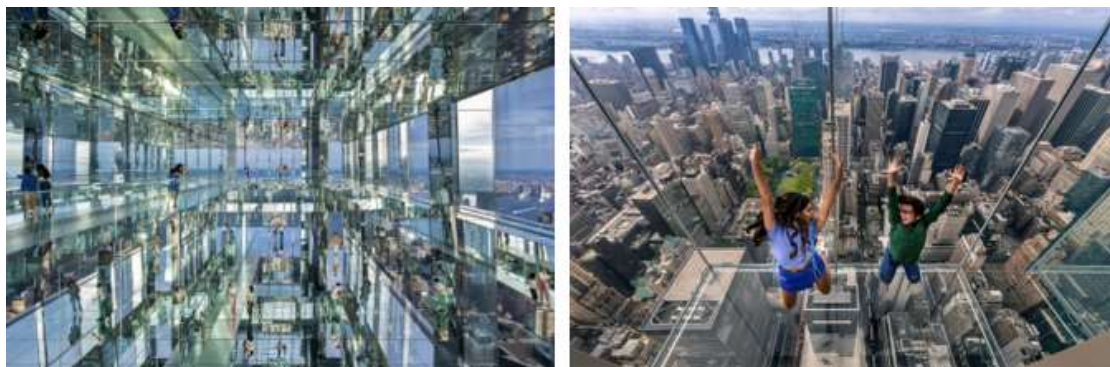
Figure 3. High strength glass

At present, glass materials can be processed into frosted glass, polished glass, colored glass, spray glass and other glass styles. These rich styles make the interior design effect more interesting. The new form of glass material can be used to create handicrafts of different styles, and the modeling is more artistic, as shown in Figure 4. Glass diversity.