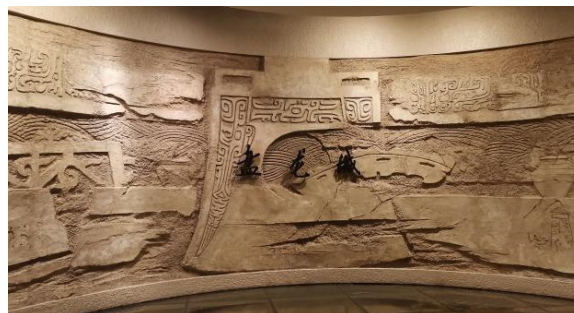
Fig. 4 Exhibition hall of Panlong city of Hubei Provincial Museum