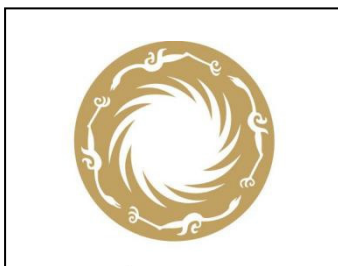
Fig. 1 Sign of Jinsha Site Museum

There are mainly two methods of logo design with regional cultural relics as regional symbols. One is to directly use the appearance of cultural relics for design, and then carry out extended design. For example, the sign of Jinsha Site Museum directly uses the cultural relics of "sun god bird gold ornaments" in the collection as the sign, which reflects the totem worship of the Shu region in Cuba. (Fig. 1) another example is the symbol of the museum in Heilongjiang Province, which is composed of the Jin Dynasty cultural relics "bronze seated dragon" excavated here, which reflects the characteristics of the Jin Dynasty culture in Heilongjiang Province. (Fig. 2)