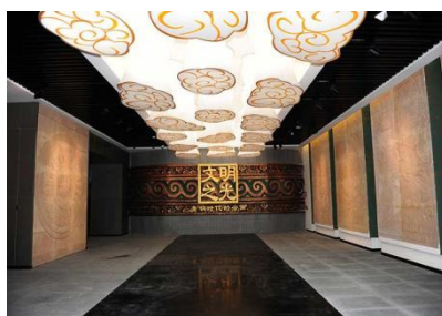
Fig. 8 Internal exhibition hall of Yunnan Provincial Museum