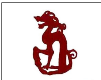
Fig. 2 Logo of Heilongjiang Provincial Museum

The second is to extract the cultural relics in the collection into visual symbols after secondary creation by means of deformation, extension and deconstruction. For example, the symbol of the Hubei Provincial Museum is to extract the elements of the treasure of the town hall, the chime bell of marquis Zeng Yi, to deconstruct the graphic symbols of the "bell" and combine them with the sound waves. It can also be understood as the repetitive lines of the chime bell outline, like the lingering aftersounds of the chime bell, with visual and auditory imagination. The graphics are simple and easy to understand, and can well express the connotation of Chu culture and Hubei bronze culture. (Fig. 3) the interior vision of Hubei Provincial Museum also uses a large number of regional cultural elements and symbols. For example, the visual design of panlongcheng Pavilion uses a large number of traditional bronze patterns of the Shang Dynasty. The audience was deeply impressed. (Fig. 4)