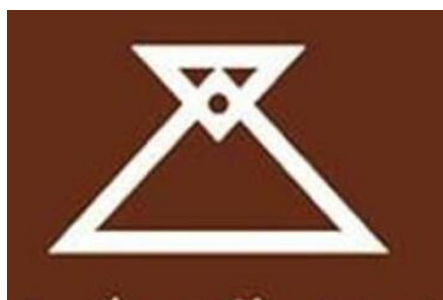
Fig. 6 Logo of Henan Museum