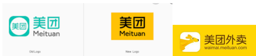
Figure 3. Meituan's changes of logo

Ever since Meituan was launched in 2010, Meituan's logo has made a few changes on the shape, typeface, and color, in order to cater to the changing consumer preferences and market needs. According to Jamie, redesigning the logo is an important step toward creating an up-to-date image and impression toward the company [3], but meanwhile, the logo should not have constant revolutionary changes because it breaks the brand consistency. A successful brand re-design can lead to more sales, a better impression and a better align with brand values. Just as Figure 3 shows, the main colors of Meituan's old logo are white and green, and it evolves into a combination of black, white and yellow. Yellow represents youth, vitality, and warmth, and makes people relate to hunger, catering to Meituan's main business of food delivery and in-door food service that should associate with vigor.