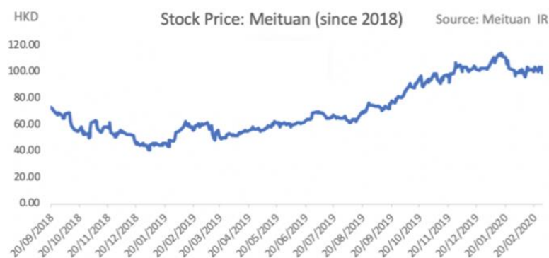
Figure 1. Meituan’s Stock Price Since 2018

Meituan, a leading innovative App for local life services, has been launched for 10 years. According to the report, Meituan owns 142 billion USD market capitalization as for July 17, 2020, and its performance after its IPO in 2018 is striking, as shown in Figure 1. Meituan starts its business from collective buying, and soon expands its business to food delivery and food review, and then initiate other businesses such as online ticketing, travel, wine, fresh-food supermarket, etc. A year after Meituan was launched, there were already 5,000 group-buying websites, and companies were facing fierce competition in the race of market share [2]. Meituan adopts the aggressive expansion strategy, as can be observed from its wide range of business and expansion from major cities to small cities [2]. With its strategic planning, corporate management, and integrated marketing strategies, Meituan’s success and dominance position seem to be inevitable. Until 2019, Meituan has become the largest food-delivery provider in China that dominates 65.1%, while its biggest competitor “Ele Me” only dominates 27.4% [2]. Therefore, Meituan’s tremendous, successful expansion within the decade is a good business model for researchers to study on and further explore.