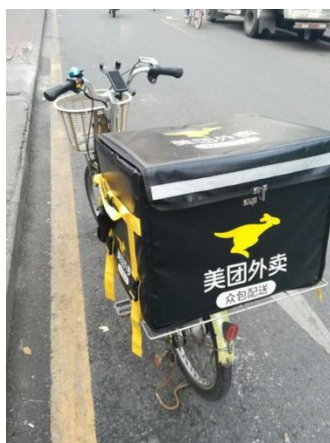
Figure 5. Meituan riders on the street