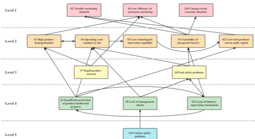
Fig. 1 Explanatory structure model of influencing risk factors of TEA DRINKS enterprises

According to Table 5 and the reachable matrix to find out the division of influencing factors between each level in turn, and can find out all the division of influencing factors and the interrelationship between them (Figure 1).