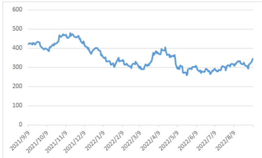
Figure 2. Lululemon Stock Graph

According to the data shown in the figure 1, [6] the net revenue received by Lululemon continuously rose during the past 14 years. From 2008 to 2017, what stands out in the graph is that the revenue increased each year steadily with a relatively stable pattern. In the recent two years, from 2020 to 2021, the net revenue experienced a dramatic soar from 4401.88 million U.S. dollars to 6256.62 million U.S. dollars, an increase of approximately 42.1%.