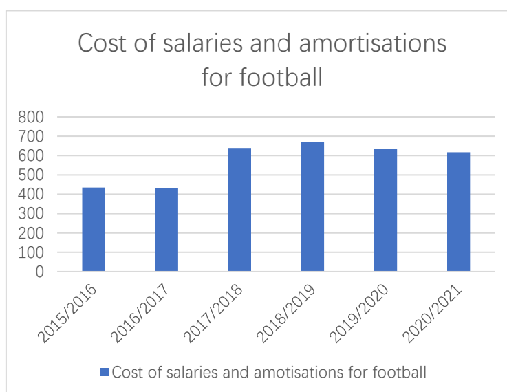
Figure 1. Cost of salaries and amortizations for football of FC Barcelona

According to the analysis chart shown in the financial statements, since the beginning of the 2017/18 season, after Dembele was signed, the overall player salary level has increased from 432 million euros to 639 million euros, and the 2018/19 season has reached an unprecedented level--- 671 millions of euros. And the following season still maintains such a high level of salary spending.