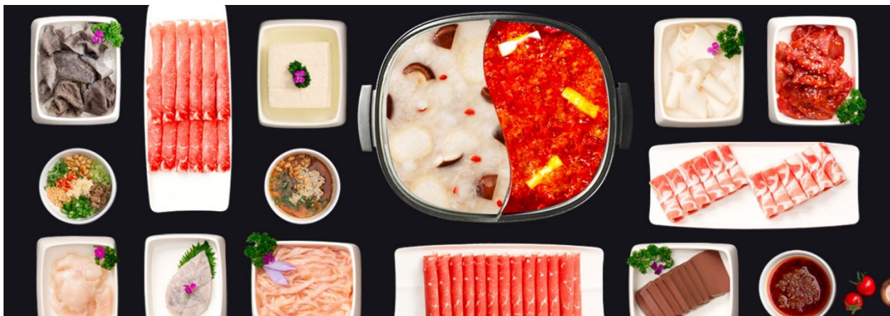
Fig. 2: The complete price list of Delivery Service in Malaysia is out! Get it now! Official Delivery Website]. [17]

Constant innovation: Haidilao looks for new ways to provide better service in the face of competitors trying to replicate its successful model. For example, it has expanded its e-commerce business on Chinese takeaway platforms, offering not only food and pots, but even waiters for on-site service, thus expanding its customer base [16].