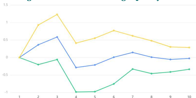
Figure 3. Response of DLNCEO to Cholesky One S.D. DLNHQD Innovation