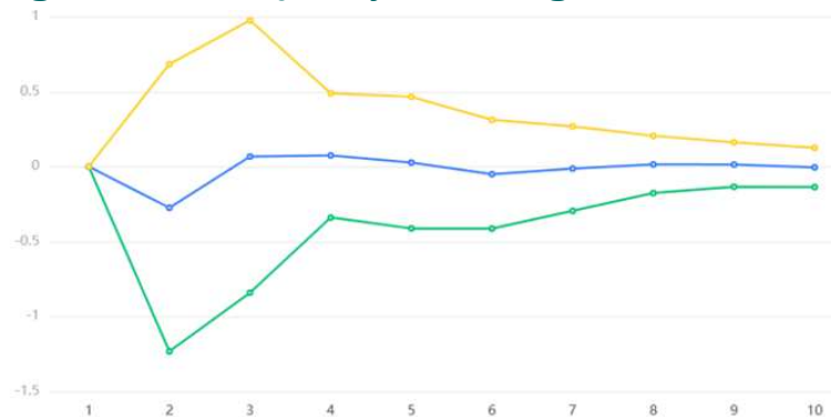
Figure 2. Response of DLNHQD to Cholesky One S.D. DLNCEO Innovation

From Figure 2, we can see the response and response path of the high-quality economic development index rate to the ecological environment index. The high-quality economic development index had no immediate impact on the eco-environmental development index at the beginning. The impact in the first phase was 0, but then there was a significant negative impact in the third phase, and returned to a positive impact in the third phase. At this time, the growth rate of the eco-environmental index increased by about 0.1 percentage point for every 1 percentage point increase in the high-quality economic development index. Since then, in the fourth and fifth periods, the economic high quality index still has a positive impact effect on the development of the ecological environment index, and after the sixth period, the impact effect of the economic high quality development index on the ecological environment index tends to be stable.