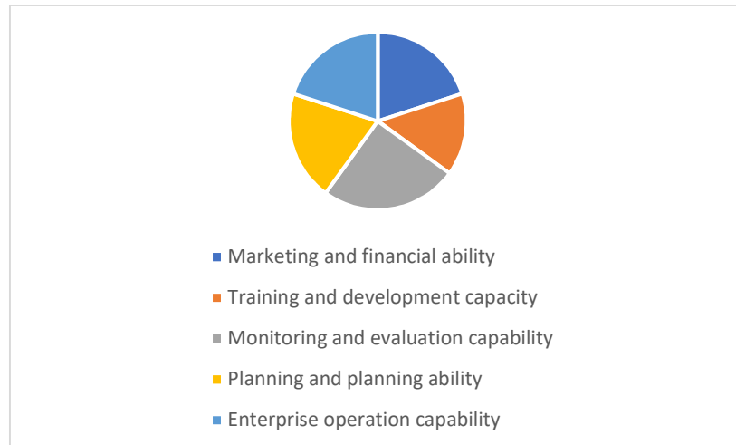
Figure 2. Skills and Proportions Required for Interdisciplinary Talents