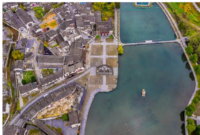
Figure 3. Xidi Town

Xidi is located 8 kilometers east of Yixian County, Huizhou City, Anhui Province (Yixian County, Huangshan City, Anhui Province). It was first built during the Youdi period of the Northern Song Dynasty and has a history of nearly a thousand years. Yixian was originally an ancient Huizhou, and Xidi is located in the west of Huizhou Prefecture. It got its name from the Nine Posts. Hongcun Village, located 10 kilometers north of Yixian County, was built in Shaoxing in the first year of the Southern Song Dynasty. It has a history of more than 800 years of Xidi. With its long and brilliant traditional culture, it has been honored to register the customs of the Ming and Qing dynasties. It is simple and unsophisticated, and it has been honored to register wood, brick, and stone carvings, which are famous throughout the country. The most distinctive houses are Dr. Di, Yingfu Hall, Dunren Hall, Xiyuan, Ruiyu Pavilion, etc. "Hu Wenguang Memorial Archway",