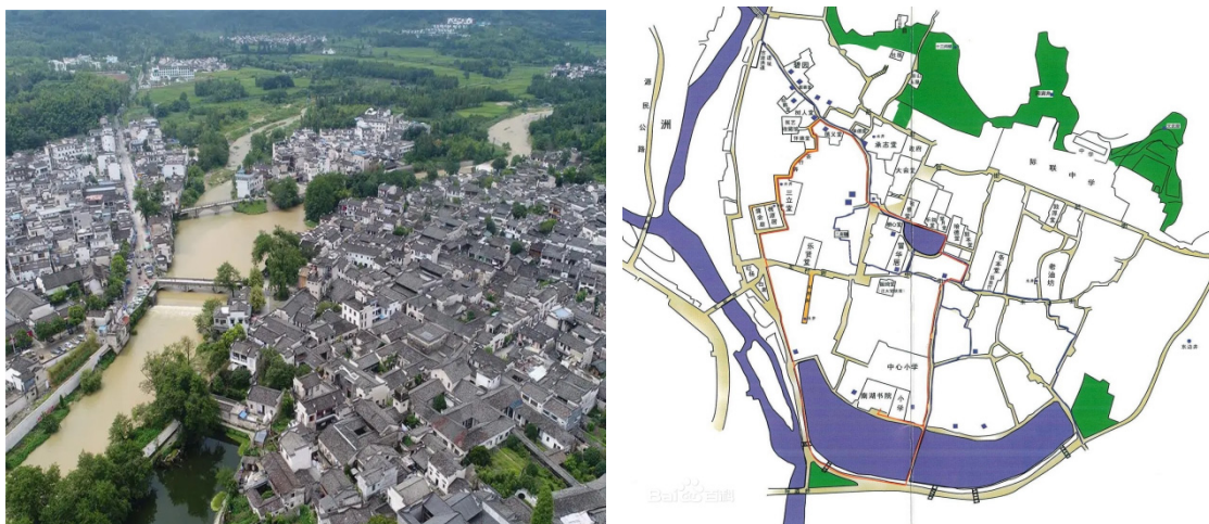
Figure 2. Hongcun Town

Hongcun is a very representative Anhui architectural village. In 2000, it was officially listed as a world cultural heritage, filling the gap of "world heritage" without villages and towns. Hongcun is located in the northeast of Yixian County, Huangshan City. It was founded in the