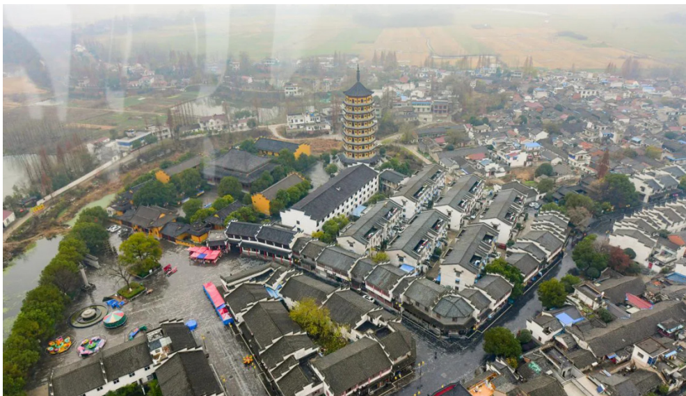
Figure 4. Sanhe Ancient Town

Sanhe Town is located in Feixi County, Hefei City, a famous city in central Anhui Province, China. Feixi County is located on the west bank of Chaohu Lake, at the junction of Lu'an and Chaohu in Hefei, about 30 kilometers away from the urban area of Hefei. Since Sanhe was named after Fengle River, Hangbu River and Xiaonan River that run through the three rivers, it has a civilization history of more than 2500 years. As early as the Spring and Autumn Period and the Warring States Period, the ancient town had taken shape. In Chinese history, the Battle of Wu and Chu broke out here, and the Taiping Army also fought here, leaving many cultural relics, such as the city wall and the courtyard of the Heavenly King's Mansion. Sanhe Town is a typical