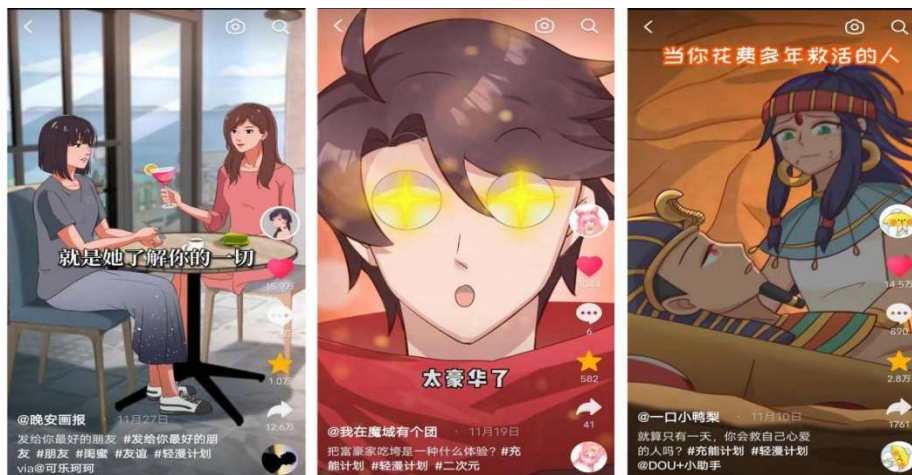
Figure 4. Screenshot of Motion Comic Works on The App of Short Video

With the acceleration of the social rhythm, the appreciation of narrative works has also added a lot of utilitarian nature. The public is no longer satisfied with the lengthy film and television narrative, but prefers to use fragmentation time to absorb the essence of the story with the shortest amount of information. In this context, narrative short videos mainly featuring mini plots have also emerged, with various movie and TV series commentary accounts, original short story accounts, sand sculpture animation accounts, new IP accounts, etc. all attempting to gain a share in the chaotic short video field.