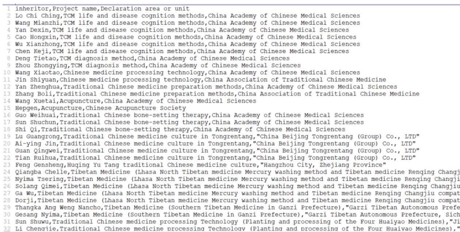
Figure 3. Captured partial data screenshot

(2) Data cleaning and preprocessing. This article uses the Pandas library for data cleaning and preprocessing. Pandas is a powerful data processing library that can easily filter, organize, and transform data.