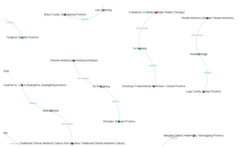
Figure 6. Query diagram of the relationship between the inheritor project name and the application area or unit (non core node)

(1) Node (point): represents an entity. In the graph, there are three types of entities in this article: "inheritor", "project name", and "applying region or unit". Each entity is labeled with a different color. For example, "inheritor" is represented in light purple, "project name" is represented in orange, and "applying region or unit" is represented in light green.