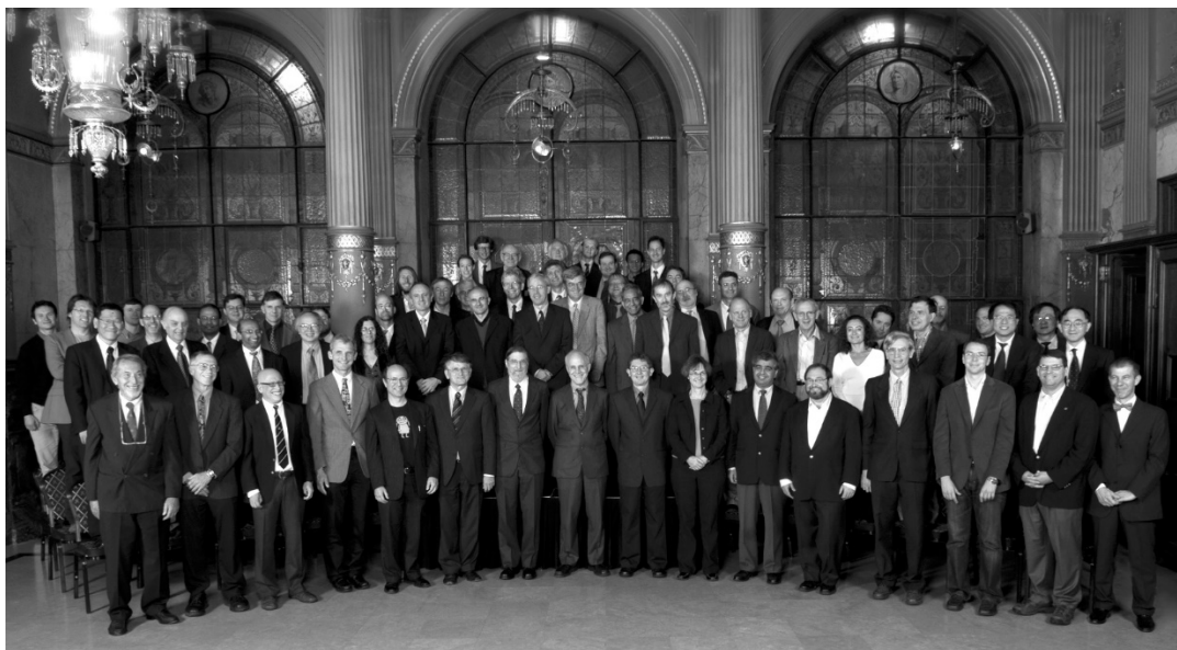
Figure 2. 24th Solvay Conference in 2008