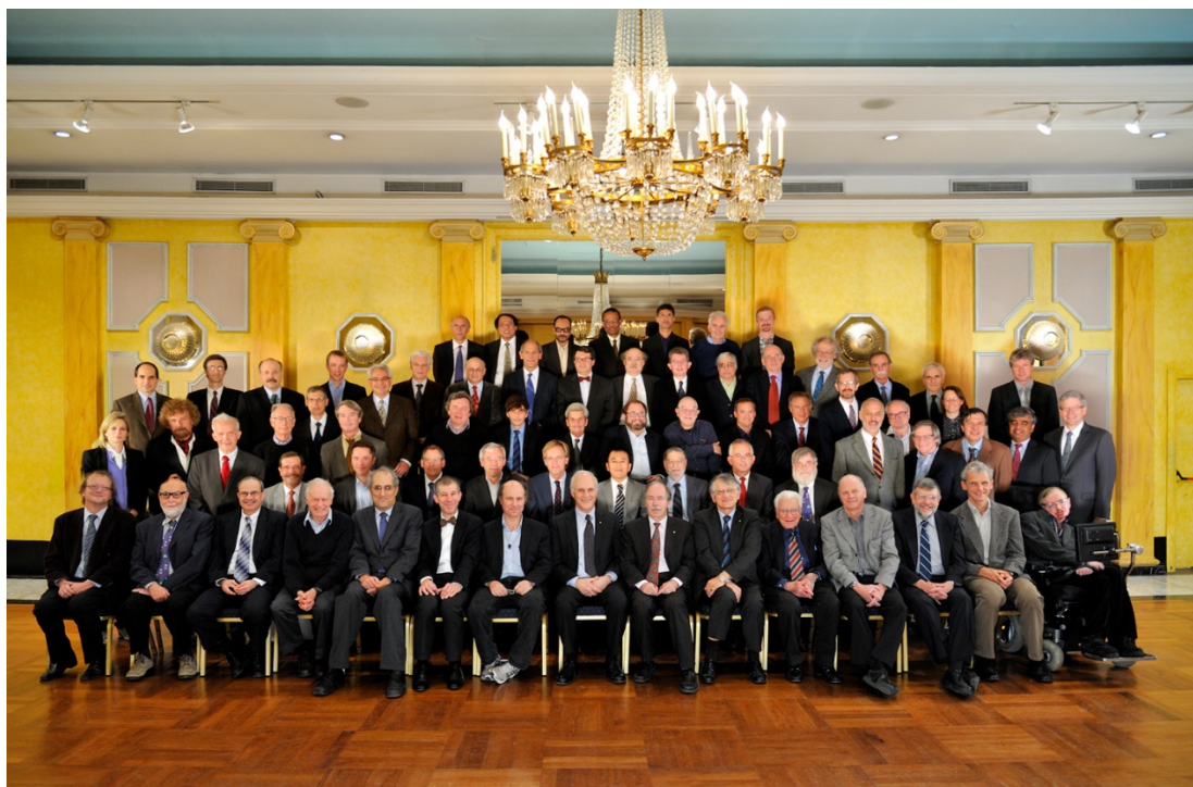
Figure 3. 25th Solvay Conference in 2011

Solvey Physics Conference is the most famous scientific conference in the world. It was sponsored by Belgian entrepreneur Solvi and held its first conference in Brussels in 1911. It was held every three to five years except for two world wars. At present, it has been held for 27 consecutive sessions (2017), and the 28th Solvay Conference will be held on May 19-21, 2022.