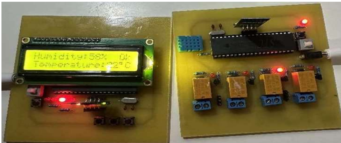
Figure 2. Screenshot of soil temperature and humidity control system test 1