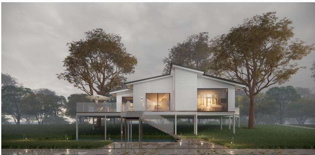
Fig 3. A rendering of the façade (Authorship)