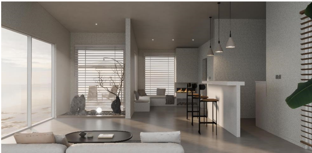
Fig 4. Living room renderings (Authorship)

The indoor floor is light yellow gray self-leveling, with white micro-cement. In the choice of soft decoration, beautifying board and wood are used to create a harmonious symbiosis between man and nature. The large area of floor-to-ceiling Windows and shutters make the scenery outside look like a shadow and a fairy, as if secluded and deep in the forest.