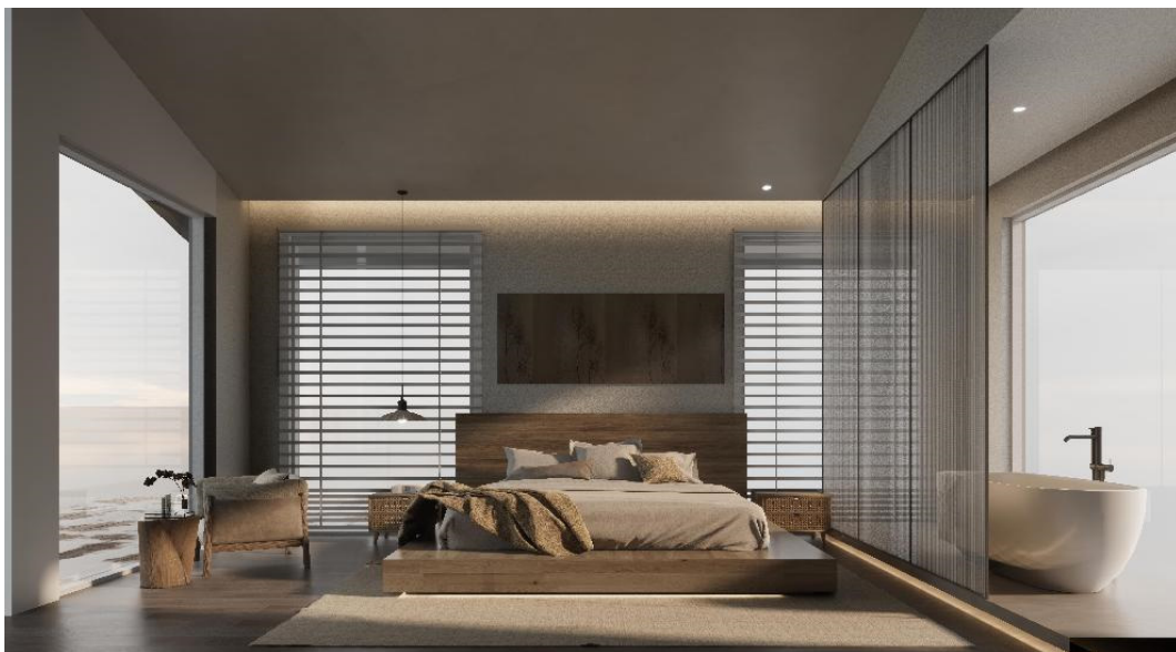
Fig 5. Bedroom renderings (Authorship)