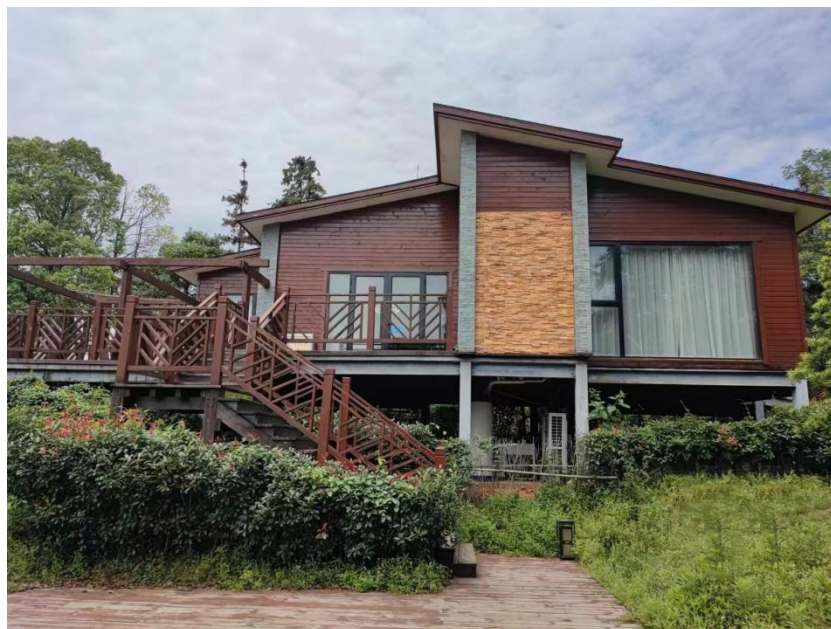
Fig 1. Phoenix Tea House two-room scene (Field shooting)

pays attention to the use of regional elements, such as the use of Nanchang traditional handicrafts decoration, tea culture theme design elements and experience activities, as well as country house water town style architecture and landscape layout, to bring guests a unique Nanchang regional cultural experience.